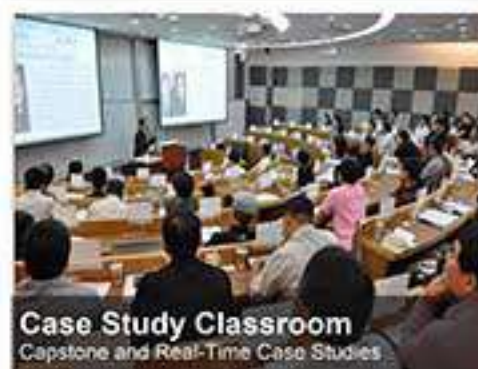
Case Study Classroom Capstone and Real-Time Case Studies

International Students ONLINE APPLICATION