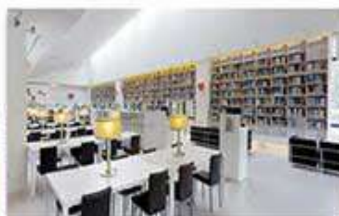
College Library Quality Business Studying Environment

The GMBA is the first English-taught MBA program launched by the College of Management as of the academic year 2018-2019. It is also the first master-level program taught in English at Tunghai University and primarily targets international students with all backgrounds.