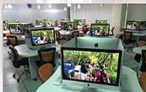
iMac Laboratory Business Project and Career Development